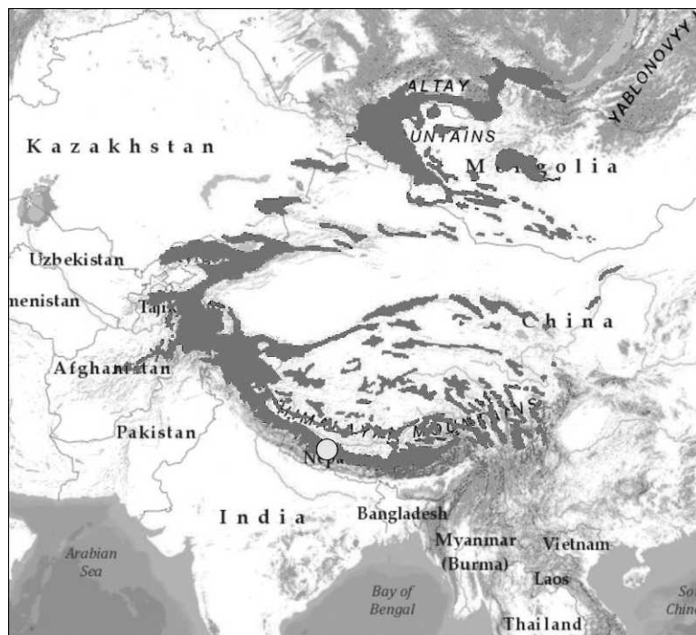
Figure 1. Global distribution of snow leopards, redrawn from Fox (1994). Our study area in Nepal is indicated by the circle displayed on the map.

prey, but like other large felids, it prefers larger ungulates because these confer most net energetic gain per unit effort expended. Thus, throughout its wide range, bharal (blue sheep/naur) Pseudois nayaur and Asiatic ibex Capra ibex constitute its preferred and stable, natural diet.