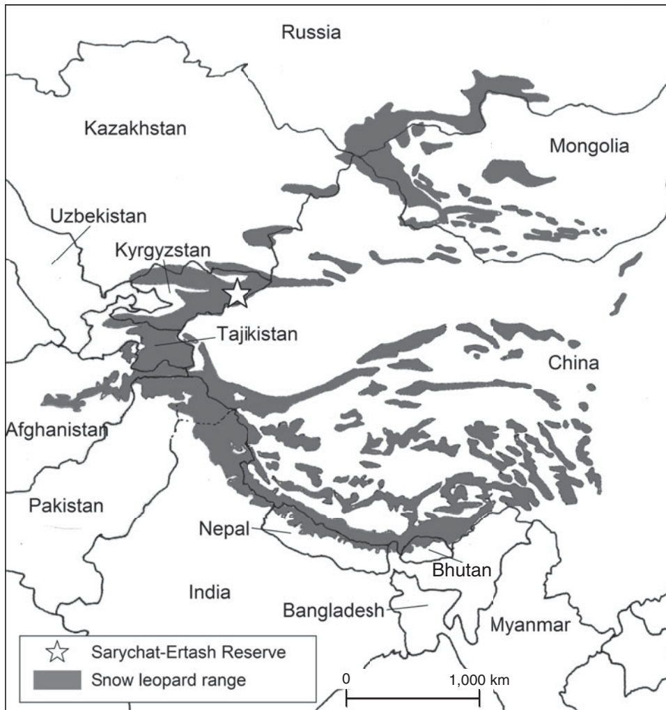
FIG. 1 Snow leopard Panthera uncia range, adapted from Fox (1994), and the location of the study area, Sarychat-Ertash Reserve, in Kyrgyzstan.