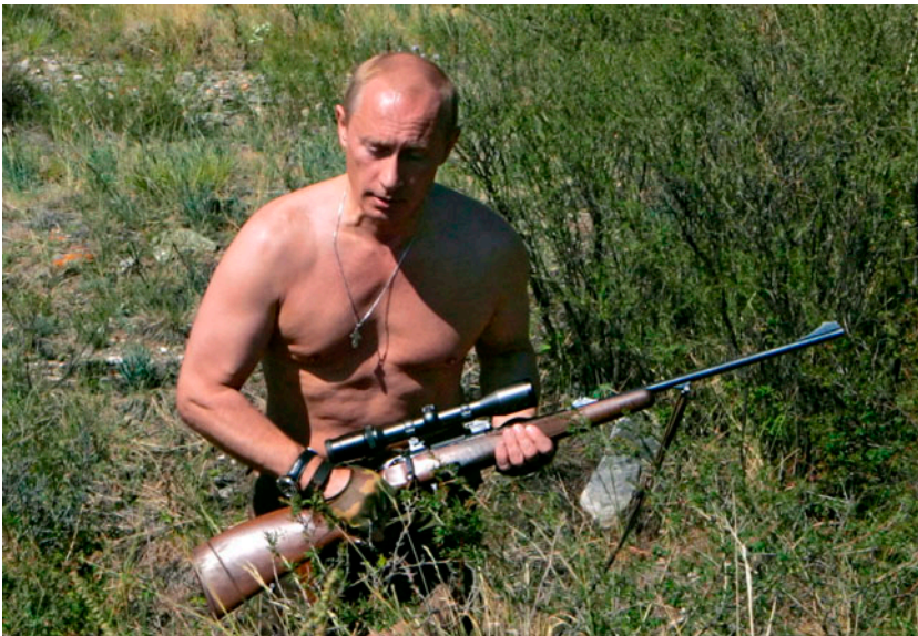
Figure 4. Vladimir Putin on a hunt in the Tyva Republic, 2007.