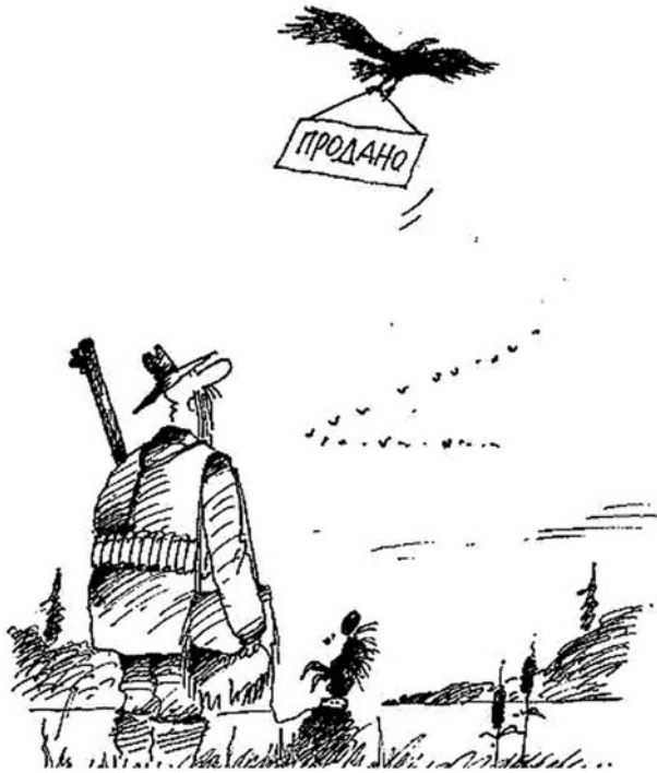
Figure 3. Editorial cartoon on privatization of hunting resources by artist Mikhail Larichev, Vecherniy Peterburg , October 20, 2009. Translation: "Sold".