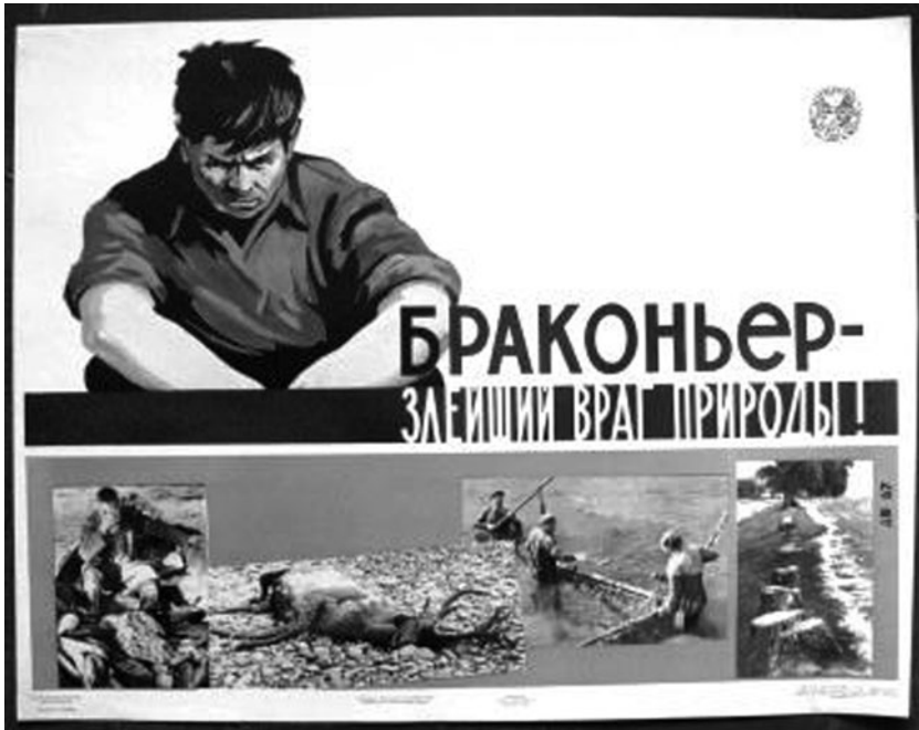
Figure 2. 1969 Soviet government anti-poaching poster by artist A.A. Shkrabo. Translation: “A Poacher Is the Worst Enemy of Nature!”.