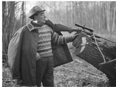
Figure 1. Historic Images of VIP Hunters. Top: Tsar Nikolay II at hunt in 1900 http://www.ebf-tour.ru/articles.htm?id=631 ; bottom left: Nikita Khrushchev (Leader of USSR from 1958 to 1964) and Josip Broz Tito (President of Yugoslavia) on a moose hunt 1961. bottom right, Leonid Brezhnev (Leader of USSR from 1977 to 1982) hunting, 1973. Websites accessed January 10, 2015. Source: Permission was obtained from the copyright holder.